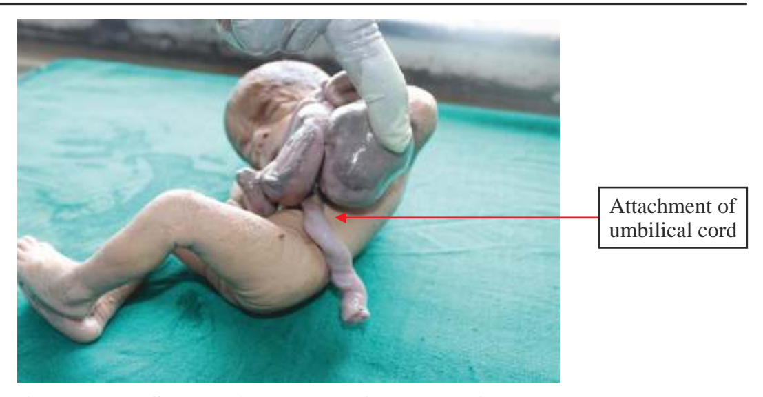
Fig. 1: Large Omphalocele Showing Attachment of Umbilical Cord over Membranes